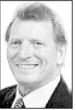
PRIME MINISTER BALDWIN