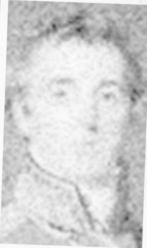
Duke of Wellington

their hands in surrender at the sound of any loud bang, which kept happening during their unsuccessful assault on Russia in 1812.